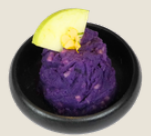
Purple Sweet Potato Salad 沖繩青蘋果紫薯沙律