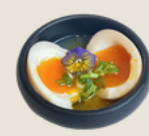
Soft Boiled Egg 溏心蛋