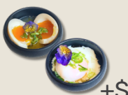
Soft Boiled Egg / Onsen Egg 溏心蛋 / 溫泉蛋 +$8