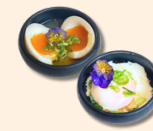
Soft Boiled Egg / Onsen Egg 溏心蛋 / 溫泉蛋