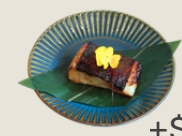
Miso Halibut 味噌比目魚 +$8