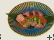
Grilled Blade Steak 牛版健 +$28