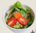
Quinoa Salad 藜麥沙律