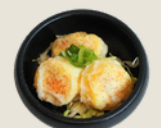
Deep Fried Egg Tofu 椒鹽玉子豆腐