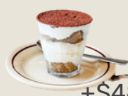
Tiramisu 提拉米蘇 +$48