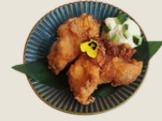
Karaage Chicken 南蠻炸雞配他他醬