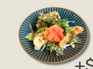
Wasabi Mayo Gyoza 3pc 山葵醬餃子(3隻) +$20