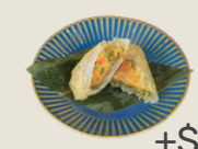
Homemade Crispy Spring Roll 自家製酥脆蝦肉春卷 +$18