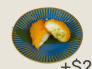
Crab Croquette 蟹肉忌廉可樂餅 +$28