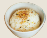
Japanese Pearl Rice 日本珍珠米