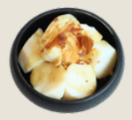
Wasabi Nagaimo-Zuke 山葵山藥漬