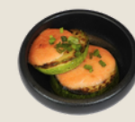
Mentaiko Jade Cucumber 明太子翠玉瓜