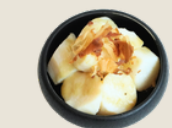
Wasabi Nagaimo-Zuke 山葵山藥漬