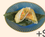
Homemade Crispy Spring Roll 自家製酥脆蝦肉春卷