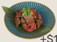
Si-Chuan Spicy Ox Tongue 川辣牛舌 +$15