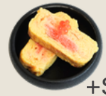
Mentaiko Tamagoyaki 明太子日式蛋卷 +$15