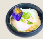
Shoyu Onsen Egg 醬油漬溫泉蛋