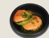
Mentaiko Jade Cucumber 明太子翠玉瓜