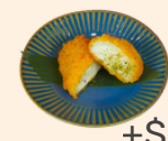
Crab Croquette 蟹肉忌廉可樂餅