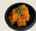
Pumpkin with Herbs 香草南瓜