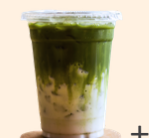
Non-coffee 其他飲品 +$15