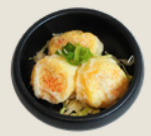
Deep Fried Egg Tofu 椒鹽玉子豆腐