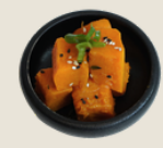
Pumpkin with Herbs 香草南瓜