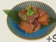
Braised Beef Brisket 牛筋腩煮 +$18