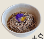
Cold Soba Noodle 紫蘇醬油醋蕎麥麵