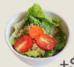
Quinoa Salad 藜麥沙律 +$10