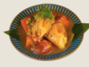
Curry Chicken 日式咖哩雞