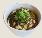
Bonito Soup Udon 木魚湯烏冬