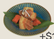
Japanese Braised Pork 豚角煮 +$10