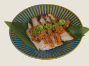
Miso Pork Collar 味噌肉燥豬頸肉