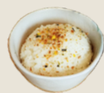
Japanese Pearl Rice 日本珍珠米