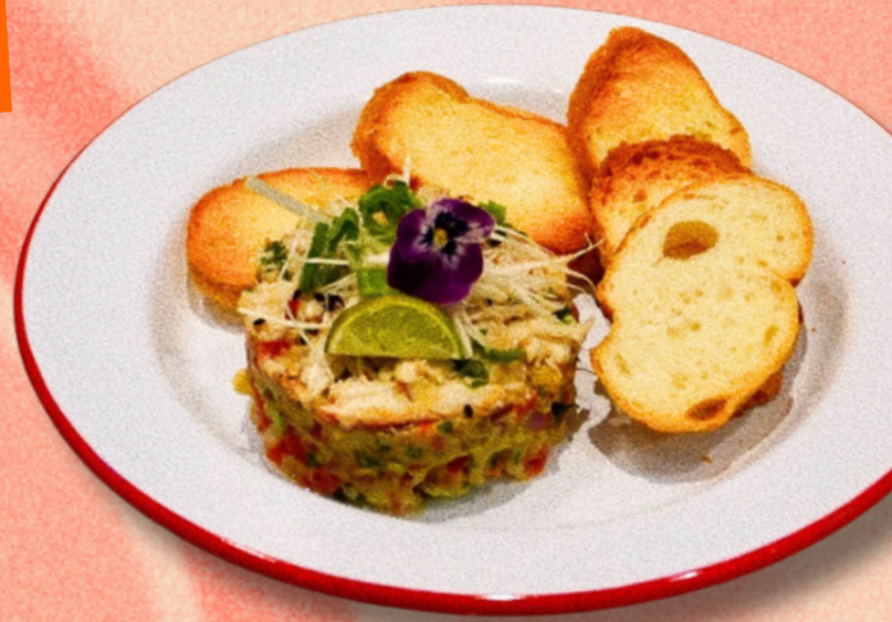
CRAB TARTARE W/ FRENCH BREAD