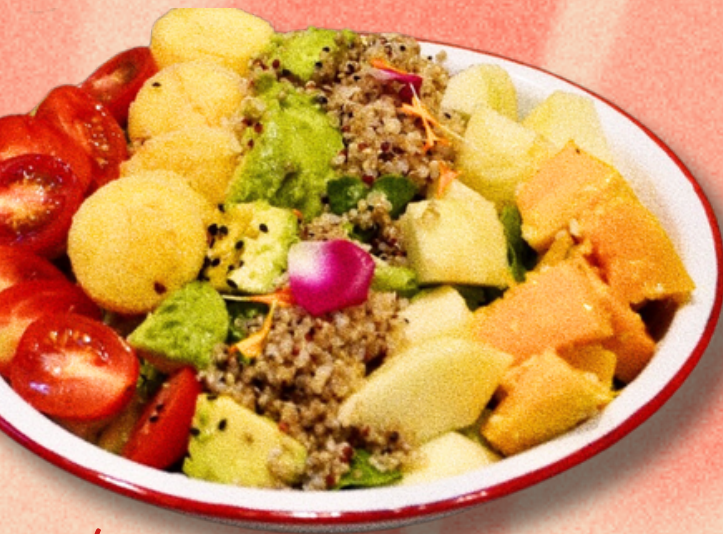
COUCH CLUB SALAD BOWL