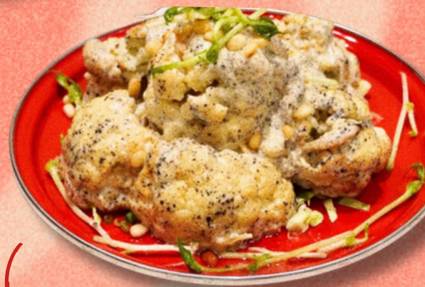
BLACK TRUFFLE CAULIFLOWER